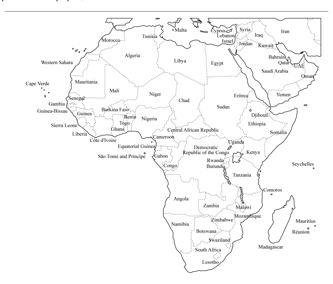
Figure 1.1: Africa

This area extends from far west Africa across the Sudanic plain as far east as the Lake Chad environs, then down to the equatorial district as well as central, east and south Africa and the major islands. This very large spread of land has many and varied peoples and cultures, but historical material is still relatively meager for most of it and from the standpoint of manuscript space, it seems best to consider it under one section.