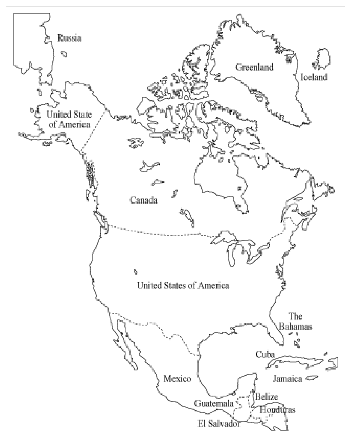
Figure 1.9: North America (This map was obtained from http://english.freemap.jp/index.html ^{20} and is used with permission under a Creative Commons Attribution 3.0 license ^{21} .)