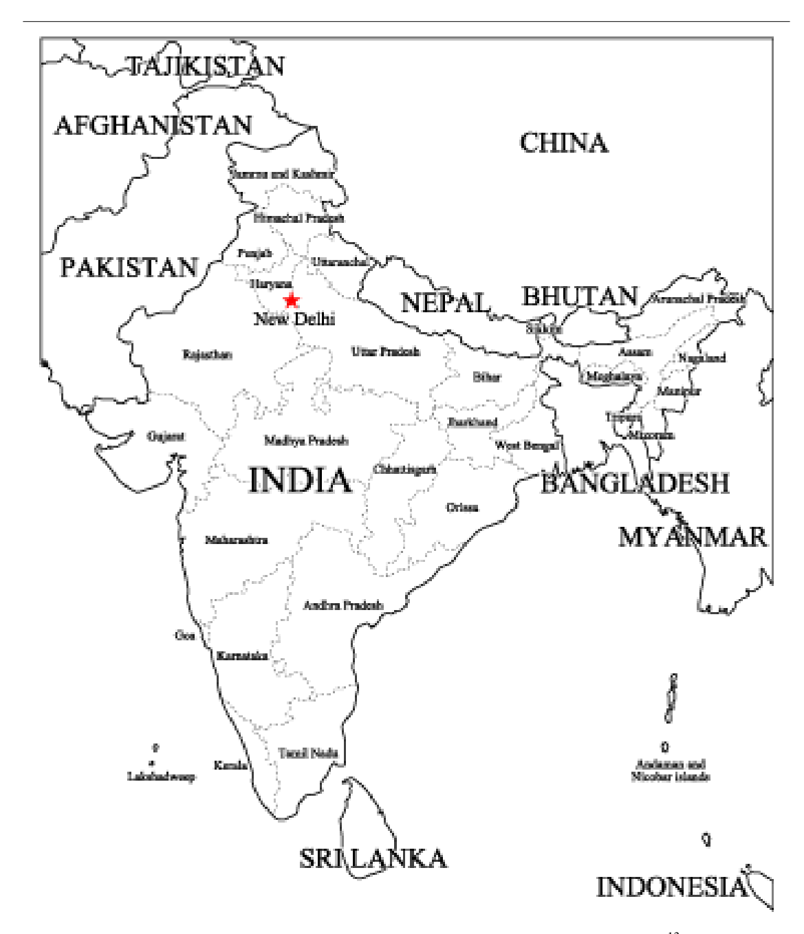
Figure 1.5: Indian Subcontinent This map was obtained from http://english.freemap.jp/index.html<sup>13</sup> and is used with permission under a Creative Commons Attribution 3.0 license<sup>14</sup>.)