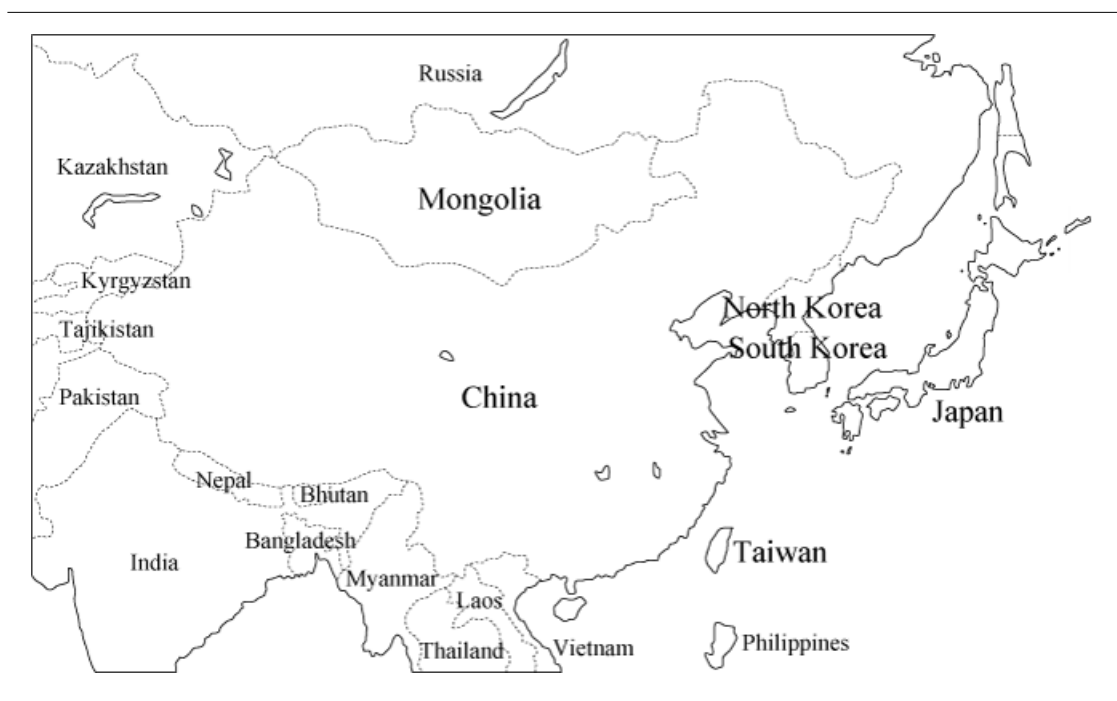
Figure 1.6: The Far East