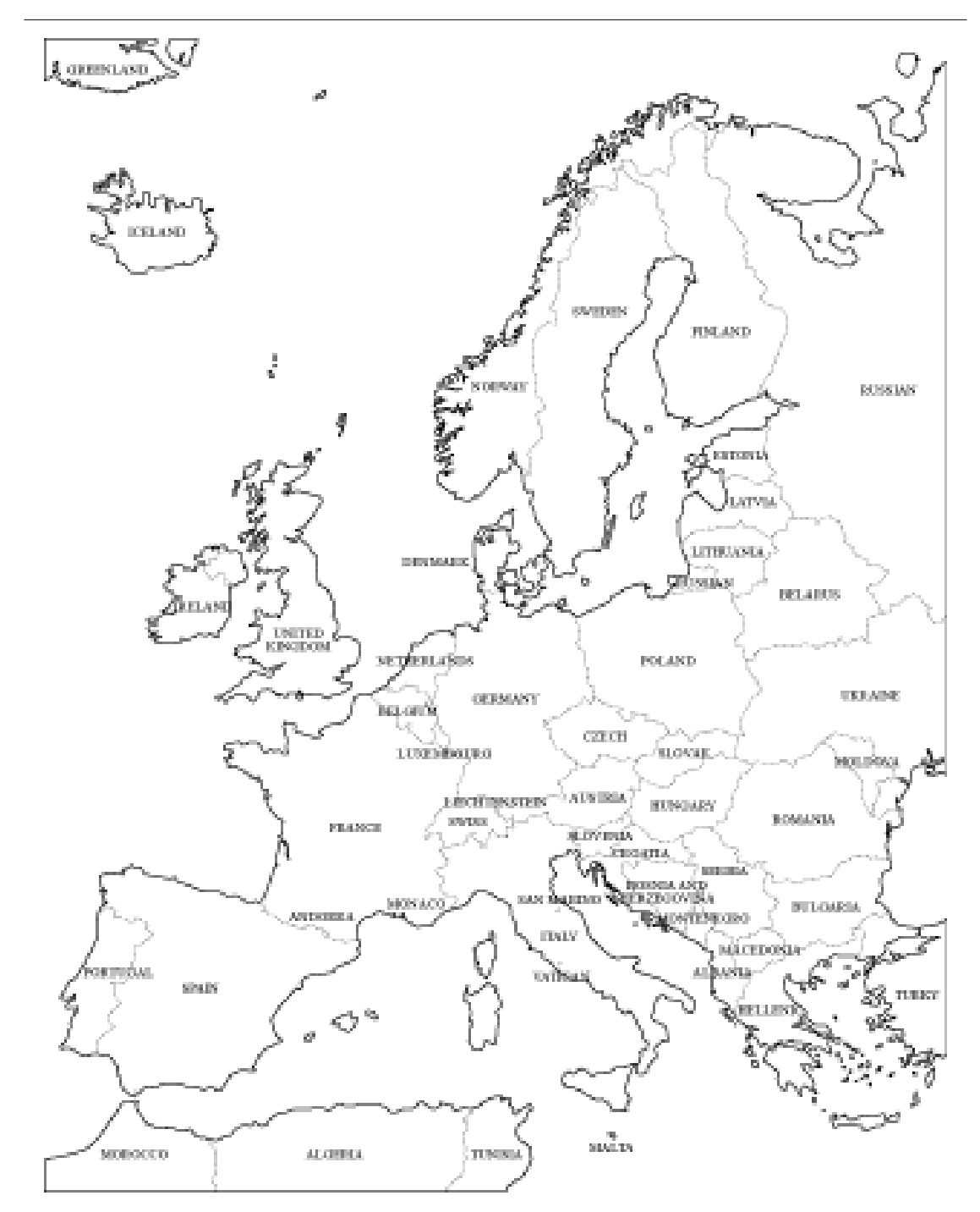
Figure 1.3: Europe (This map was obtained from http://english.freemap.jp/index.html<sup>7</sup> and is used with permission under a Creative Commons Attribution 3.0 license<sup>8</sup>.)