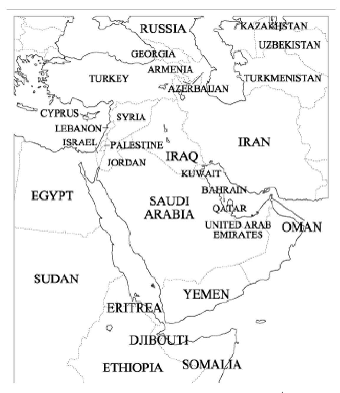
Figure 1.2: The Near East (This map was obtained from http://english.freemap.jp/index.html<sup>4</sup> and is used with permission under a Creative Commons Attribution 3.0 license<sup>5</sup>.)