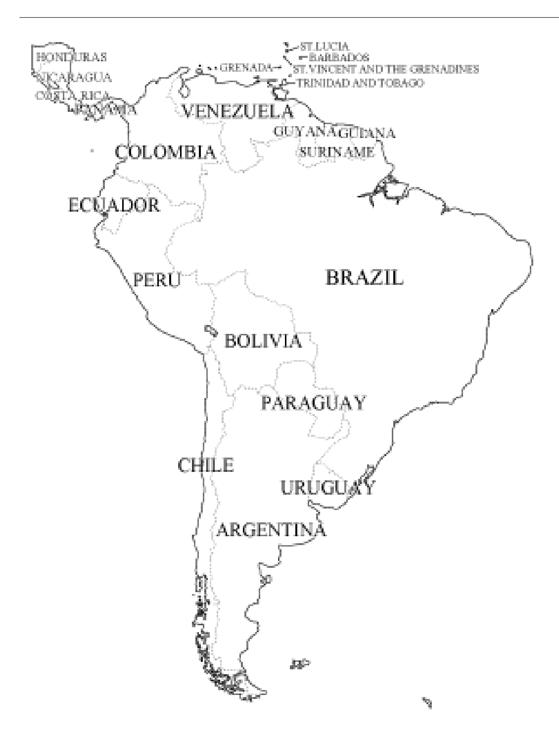
Figure 1.10: Mexico, Central America, the Caribbean, and South America (This map was obtained from http://english.freemap.jp/index.html<sup>22</sup> and is used with permission under a Creative Commons Attribution 3.0 license<sup>23</sup>.)